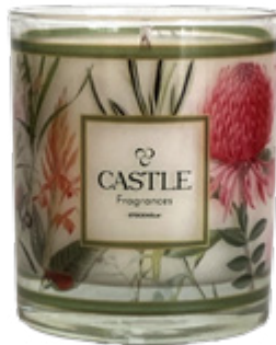
CANDLE SOLARIS Summer garden floral elegance Net weight: 200g