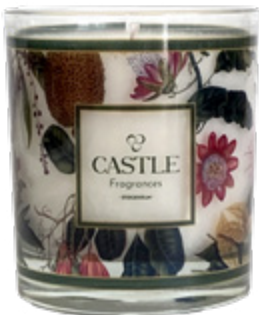
CANDLE XOTICA Tropical paradise in glass Net weight: 200g