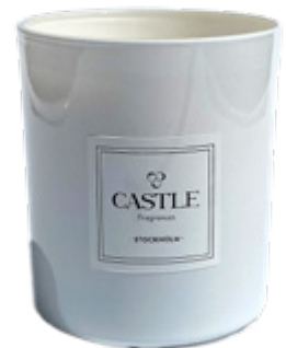
CANDLE WHITE EDITION Minimalist serenity and sophistication Net weight: 200g