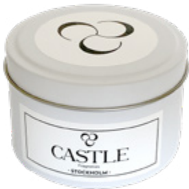
CANDLE TRAVEL WHITE White and wanderlust Net weight: 180g

Discover the urban spirit with our stylish travel candles and scented tea lights that are your perfect companions at home or on your travels and outdoor adventures, infusing every moment with a touch of elegance.