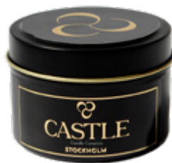
CANDLE TRAVEL BLACK MINI Travel-sized coziness Net weight: 90g