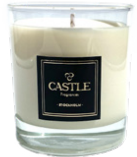
CANDLE ALL SEASONS 2 Sleek, clear, and stylish Net weight: 200g