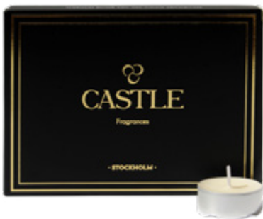
SET OF 12 SCENTED TEALIGHTS Aromas in every flicker Net weight: 165g