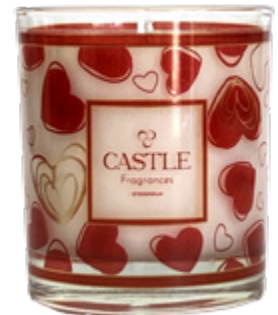
CANDLE AMOUR Heartwarming glow Net weight: 200g