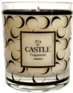
CANDLE CASTLE Elegance in clear glass Net weight: 200g

Our captivating Design Collection, where artistry meets stunning designs adorning our clear glass candle vessels, perfectly tailored to complement your home interior to new heights of aesthetic brilliance.