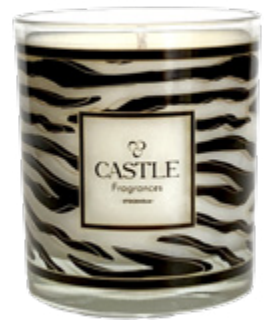
CANDLE ZEBRA Timeless stylish zebra allure Net weight: 200g