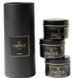
SET OF 3 MINI TRAVEL CANDLES Three fragrances, one journey Net weight: 3 x 90g