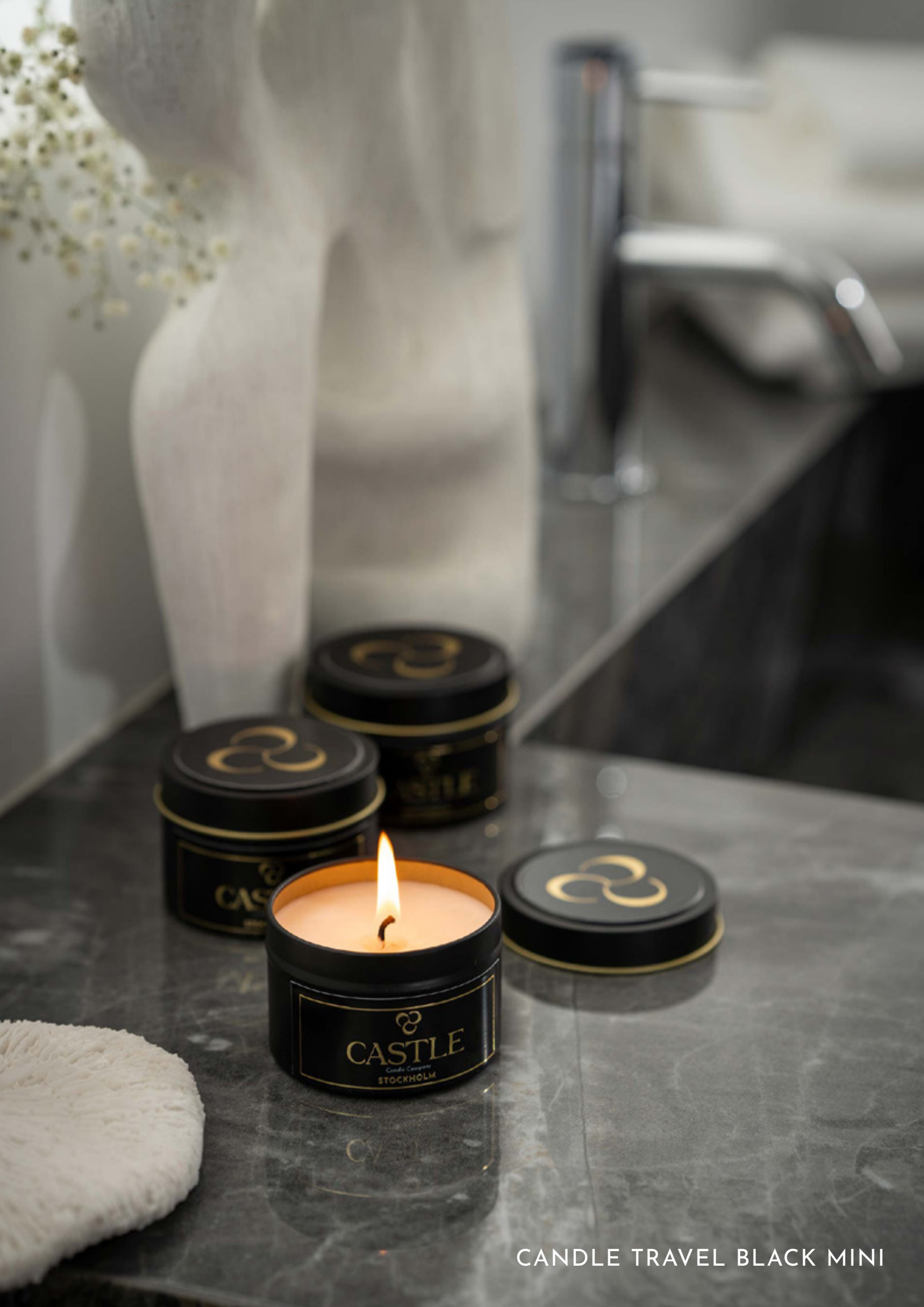
CANDLE TRAVEL BLACK MINI