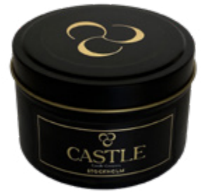
CANDLE TRAVEL BLACK Luxury on the go Net weight: 180g