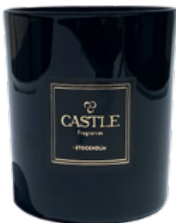
CANDLE BLACK EDITION Mystery and sophistication Net weight: 200g