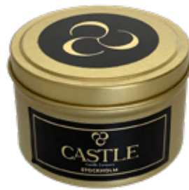
CANDLE TRAVEL GOLD Radiant travel companion Net weight: 180g