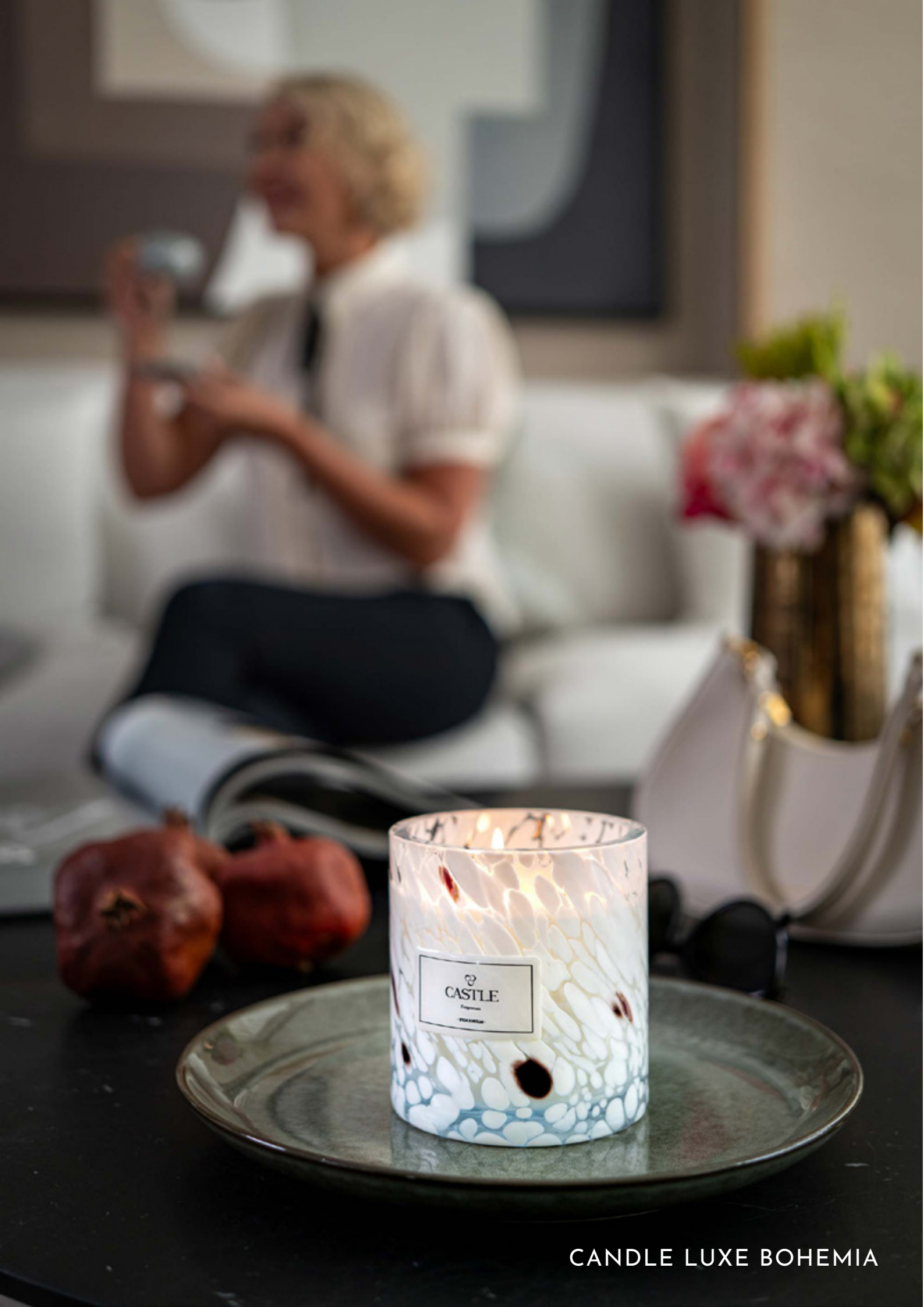
CANDLE LUXE BOHEMIA