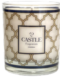
CANDLE ALHAMBRA Navy blue/gold tile beauty Net weight: 200g