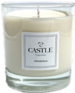
CANDLE ALL SEASONS 1 Simplicity meets sophistication Net weight: 200g

With our Signature line, we embrace the art of simplicity, offering a harmonious blend of classic black and white design where timeless elegance meets captivating scents.