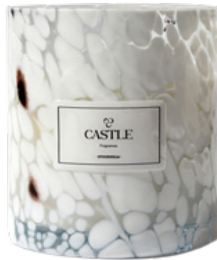
CANDLE LUXE BOHEMIA Hand-blown glass, elegance in light Net weight: 350g