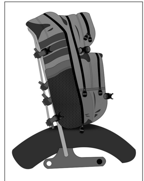
Fig (A) Bag Installed to Sissy Bar

Clean with warm water and mild detergent. Air-dry only.