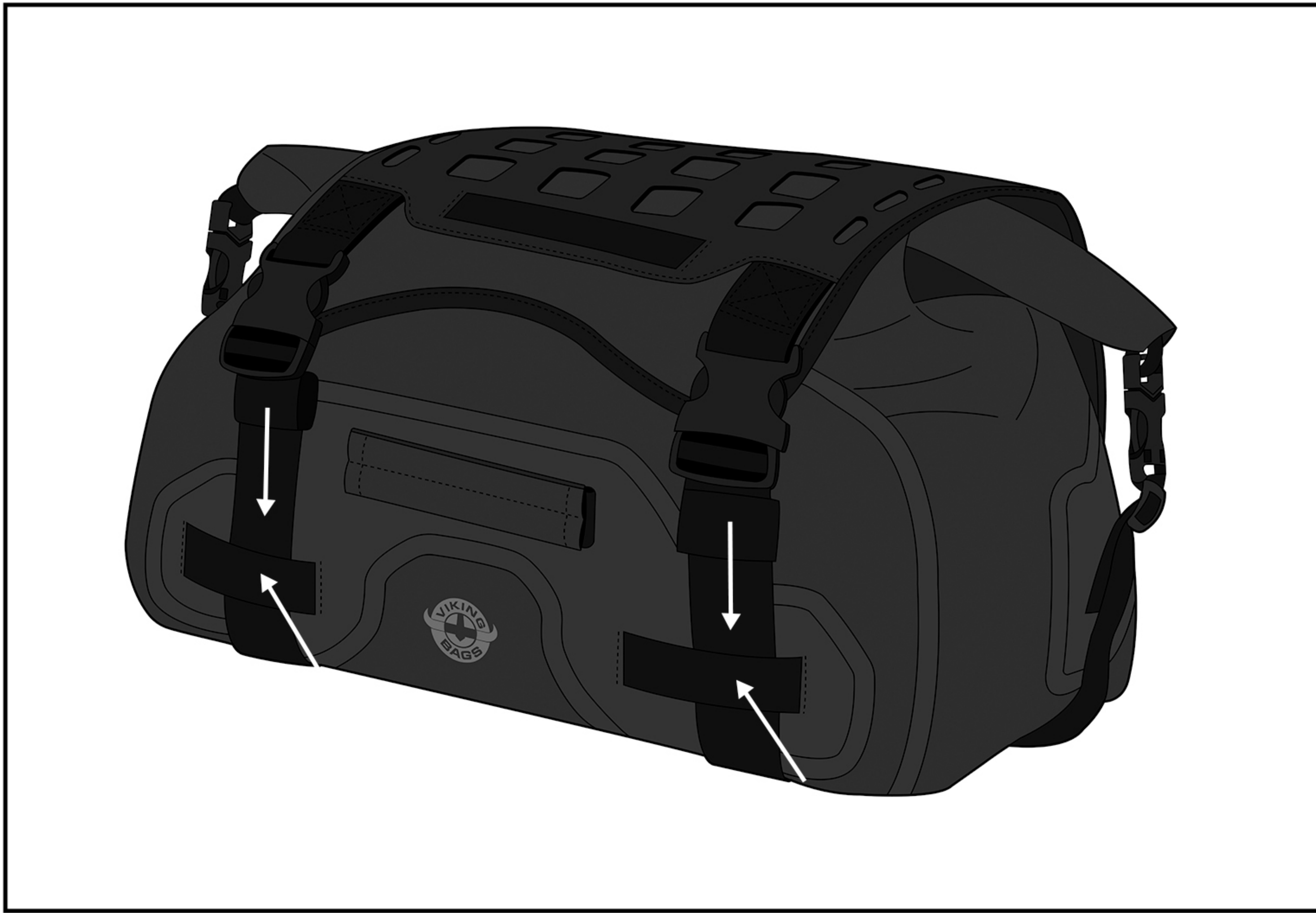
Fig 1. Attaching both the expansions