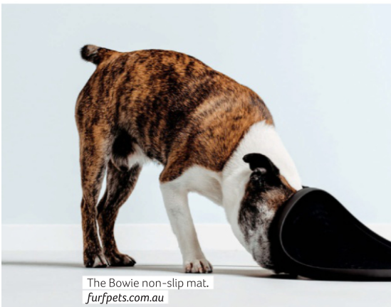
The Bowie non-slip mat. furfpets.com.au

What all those cardboard-box-loving cats are actually trying to tell us is that if we can come up with a container safe enough for them, they'll definitely pour themselves into it. If said container delights the human involved, so much the better! At the end of the day, classy pet furniture might beautify your home, but it's not the heart of a loving relationship with your pet. As Ilshat Garipov says when asked about her favourite everyday pet item, "Probably it's just my hand that scratches my beloved cats. Or the feeling of a warm weight on a blanket!" HD