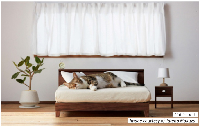
Cat in bed!

Wanderless Barkley creates unique, long-lasting dog beds with removable, machine-washable outer linings. “We use plant-based fibre to fill the beds, which, unlike other synthetic fibres, is biodegradable, naturally hypoallergenic and antibacterial,” owner Teeka Rahman says. “Pets get dirty and, unlike their