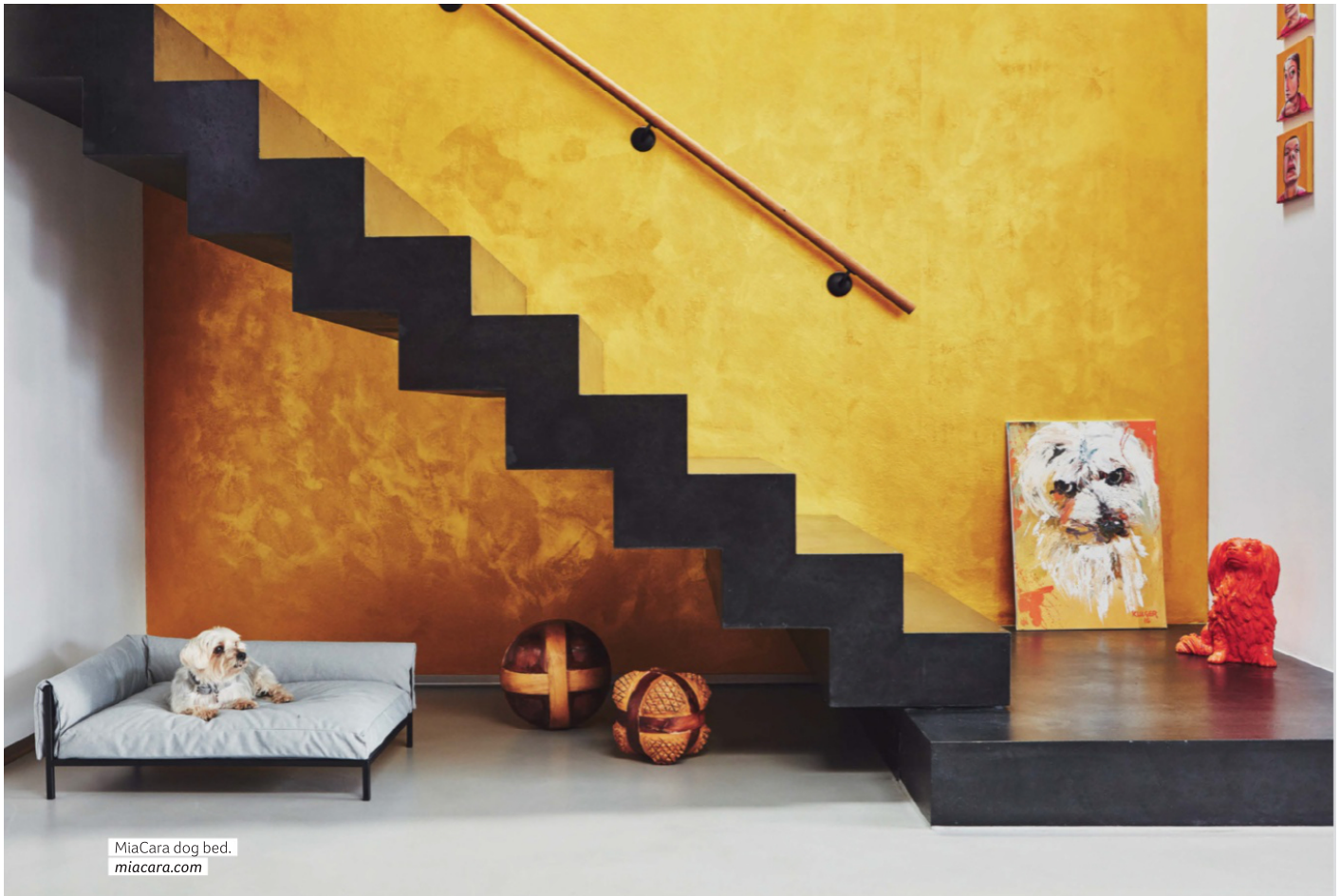
MiaCara dog bed. miacara.com