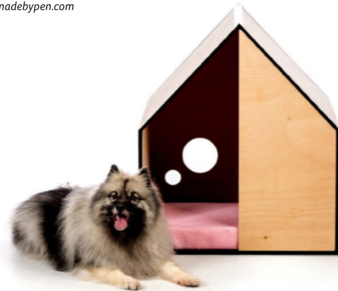
Dog Room. madebypen.com

interiors; the late Karl Lagerfeld’s beloved cats, Karl and Choupette, were the proud owners of a grey Chimère litter box. The range also includes a birdcage, fishbowl, dog/cat “sofa” and rabbit/hamster hutch. The items can serve as an artistic or decorative touch to a room as much as a practical pet solution. Solid oak is a common feature — a design element that keeps the collection “close to nature”.