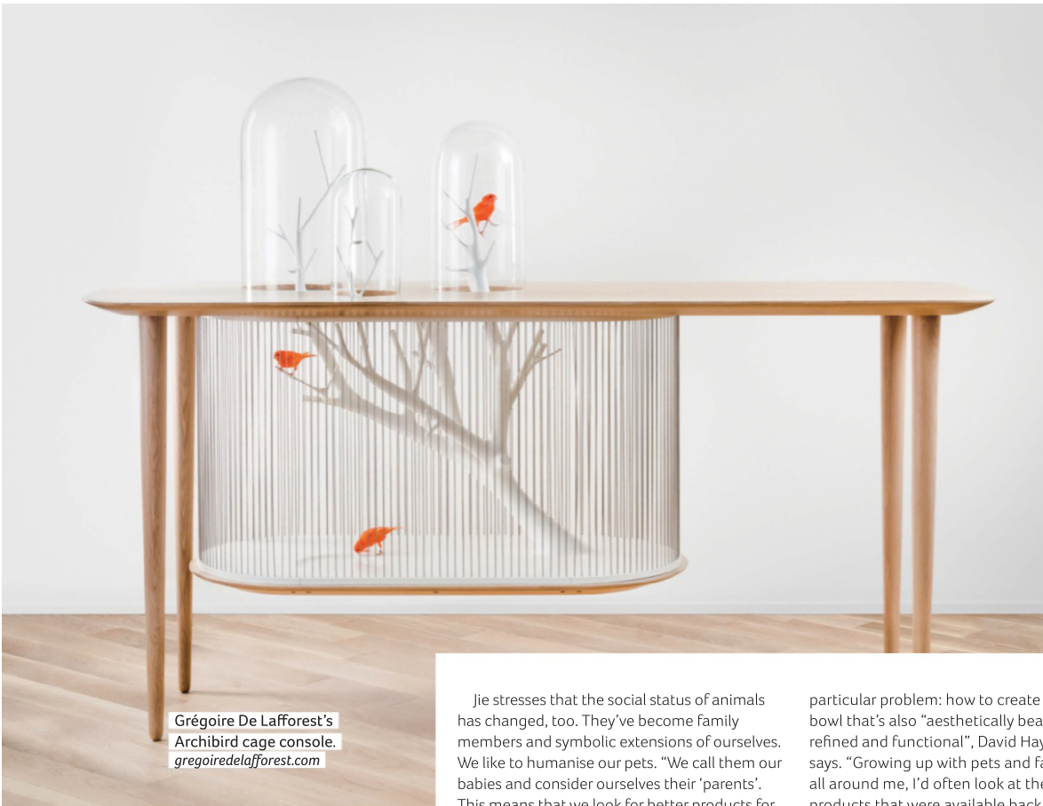
Grégoire De Lafforest's Archibird cage console. gregoiredelafforest.com