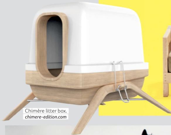
Chimère litter box. chimere-edition.com