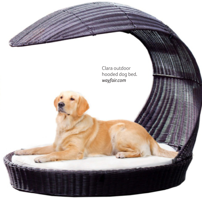
Clara outdoor hooded dog bed. wayfair.com