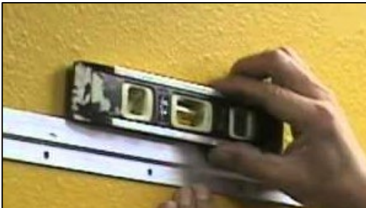
Figure 2. Locating position of Z-bar bracket.