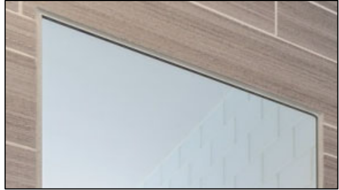
Figure 3. Grout around the mirror to seal and finish.

Caulk or grout around the edges. (see Figure 3.)