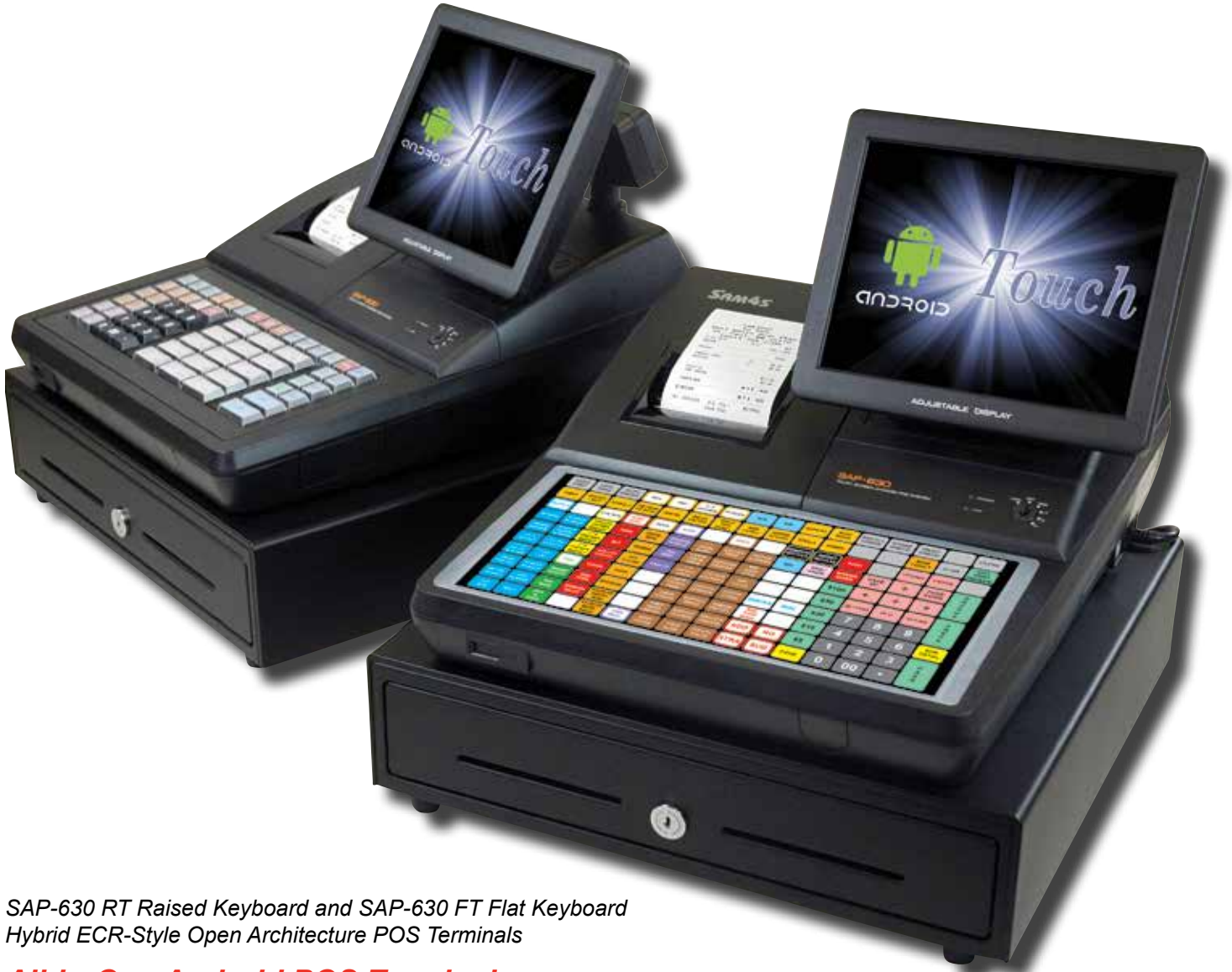
SAP-630 RT Raised Keyboard and SAP-630 FT Flat Keyboard Hybrid ECR-Style Open Architecture POS Terminals

Hybrid ECR-Style Open Architecture POS Terminals