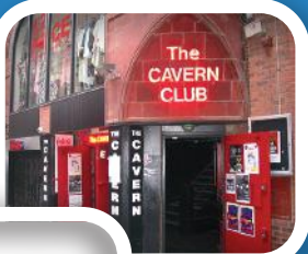
THE CAVERN CLUB

THE BEATLES FREE EXHIBITION AT CAVERN WALKS, MATHEW STREET IN POSTERS