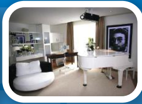
IMAGINE SUITE - HARD DAYS NIGHT HOTEL