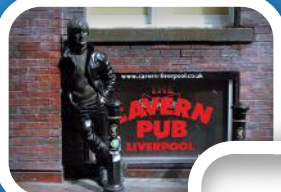
JOHN LENNON STATUE CAVERN WALL OF FAME & THE CAVERN PUB