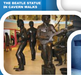
THE BEATLE STATUE IN CAVERN WALKS

THE BEATLES FREE EXHIBITION AT CAVERN WALKS, MATHEW STREET IN POSTERS