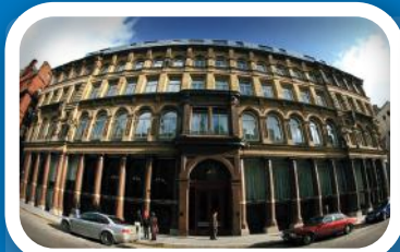
HARD DAYS NIGHT HOTEL & HARD DAYS NIGHT SHOP