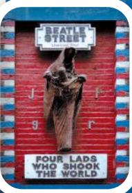
ARTHUR DOOLEY'S BEATLE SCULPTURE