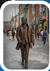
BRIAN EPSTEIN STATUE