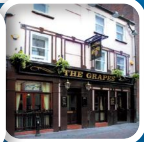
THE GRAPES PUB