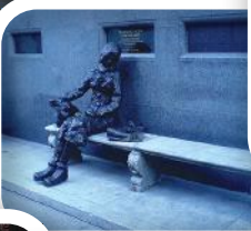
EXHIBITION AT CAVERN WALKS