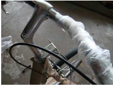
Insert the stem into head tube

When setting up the handlebar, insert the stem to the head tube, make sure the front wheel and handlebar are in right positions before you secure the handlebar. Also you can adjust the handlebar to a suitable position by loosening the nut in the third picture.