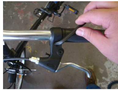
D: Rotate the lever and tighten