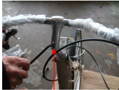
Secure the stem