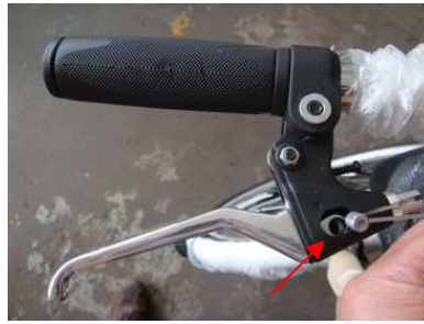
B : Insert the cable into the hole