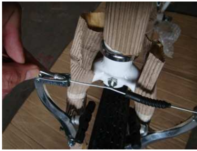
A: Release the brake cable