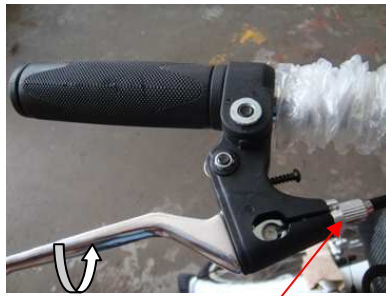
C: Lock the cable