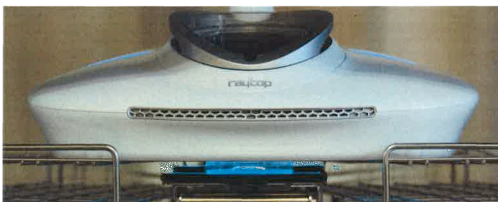
Picture 2. Appearance of UV irradiation