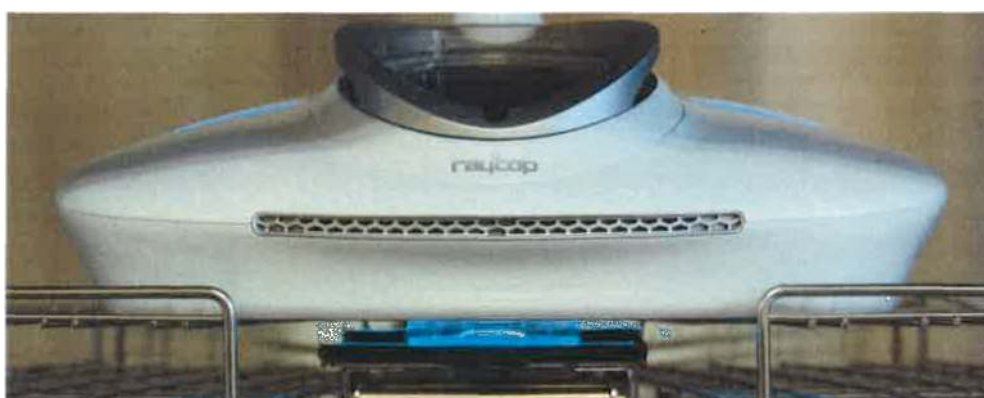
Picture 2. Appearance of UV irradiation