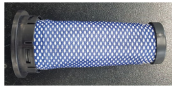
< Fabric Filter >