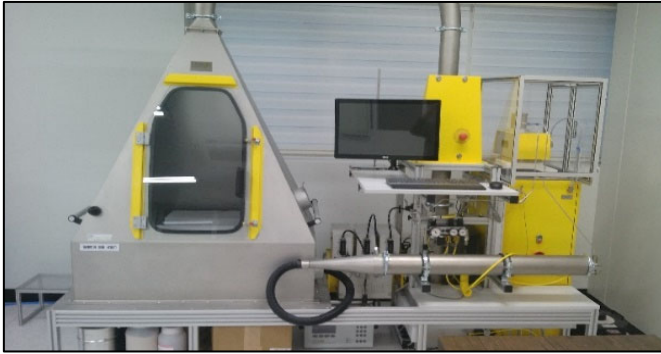
TOPAD Dust Emission Tester