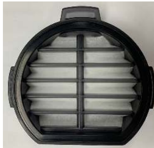
< HEPA Filter >