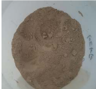
< Dust for Test Use >