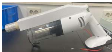
< RSC MAIN BODY >