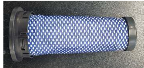
< Fabric Filter >