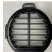
<HEPA Filter (13 degree) >