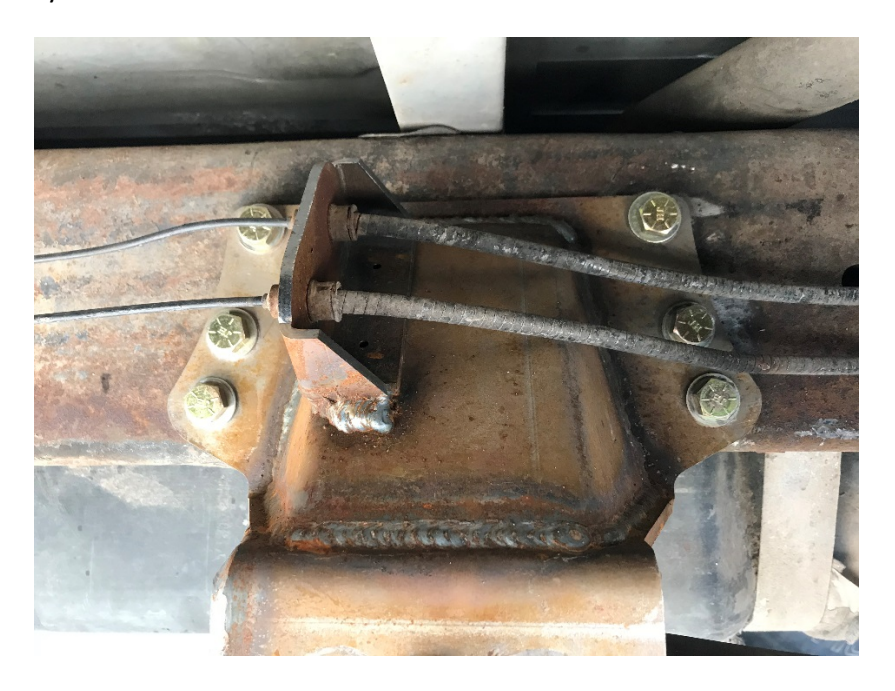
8. Install rear tires and you're finished!

7. To install ebrake bracket, run the cables through the two large holes and position on the hanger to where you have enough slack on the axle side. We weld them in place, there are two pilot holes in the bracket for bolt holes if you choose to attach it that way. For a lifted truck you may need to loosen your cable adjuster, flip bracket around, and slide towards the rear to give enough slack for the suspension to cycle.