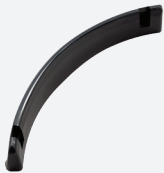
EAA0304G15A Bead Breaker Sleeve