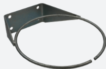
4025460 5kg Lube Bucket Holder