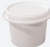
1970995 5kg Lube Bucket