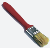
EAA0304G16A Lube Brush