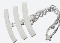
EAA0304G52A Plastic Rim Protector