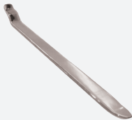
EAC0097G47A Wave Lever