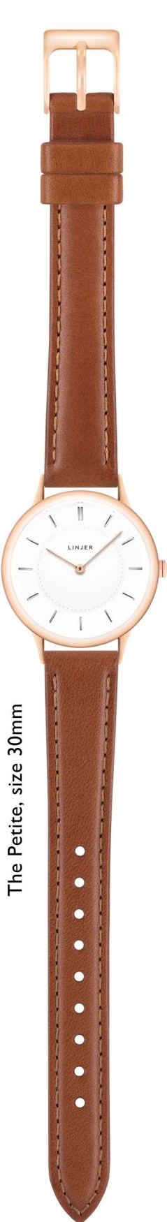
The Petite, size 30mm

The Classic Watch and The Minimalist Watch have the same dimensions. All images to scale.