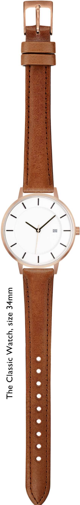
The Classic Watch, size 34mm