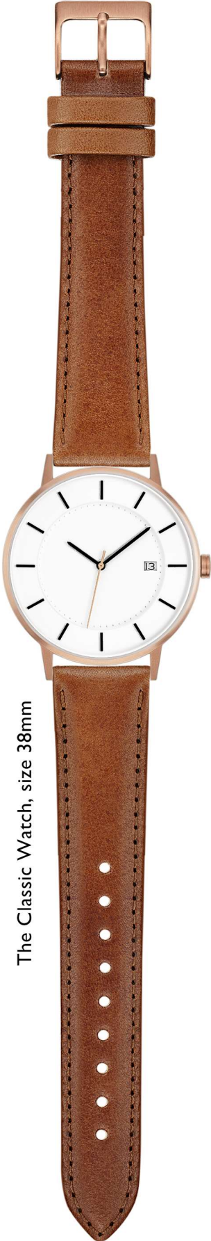
The Classic Watch, size 38mm