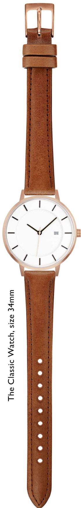
The Classic Watch, size 34mm