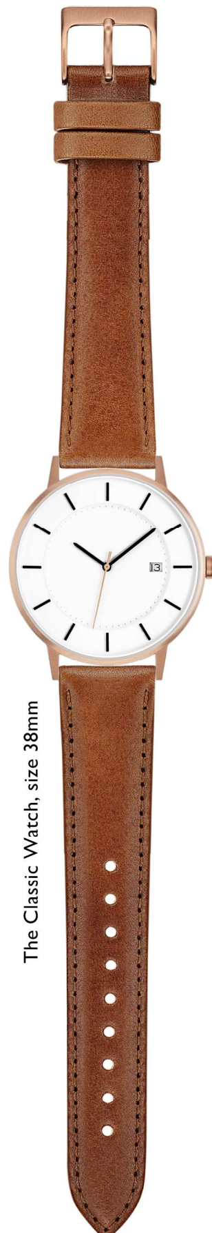
The Classic Watch, size 38mm