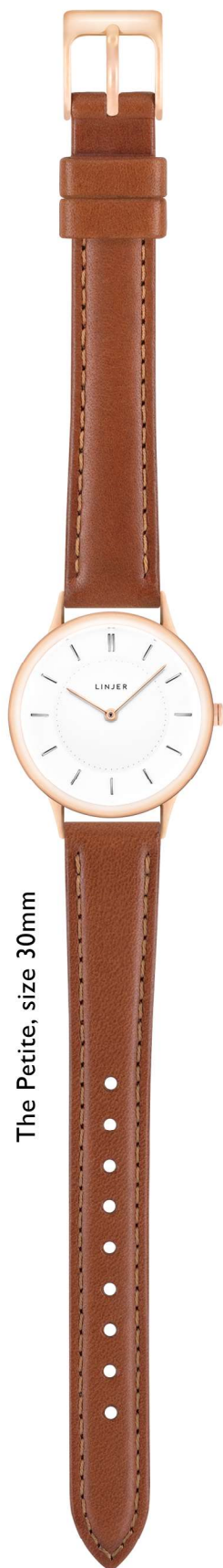
The Petite, size 30mm

The Classic Watch and The Minimalist Watch have the same dimensions. All images to scale.