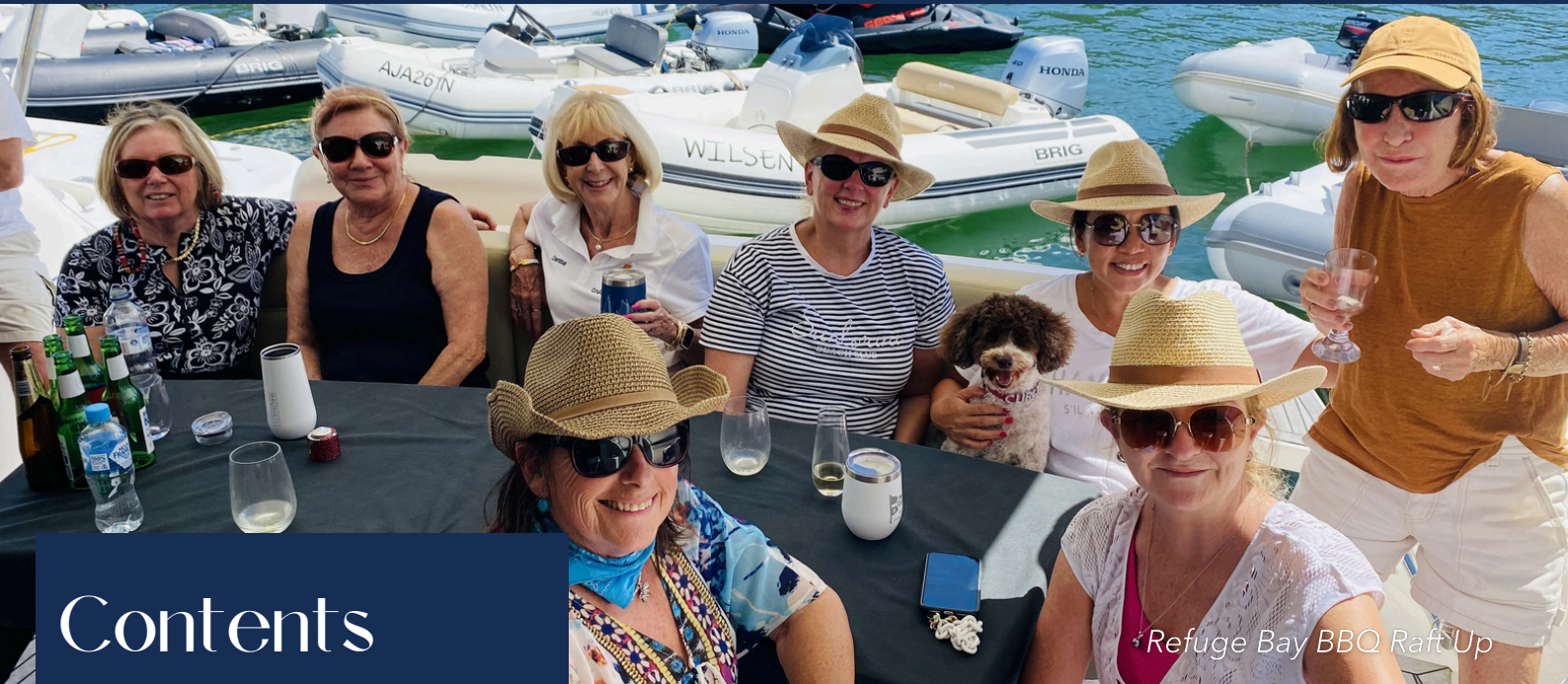
Refuge Bay BBQ Raft Up