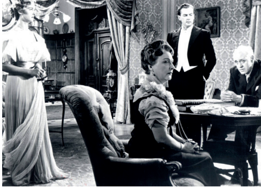
An Inspector Calls starring Eileen Moore, Olga Lindo, Brian Worth, and Alastair Sim

Without the Inspector, the characters are free to react how they like. Mr and Mrs Birling are eager to discredit the Inspector, and present him as “a fake”, a “socialist or some kind of crank”, and