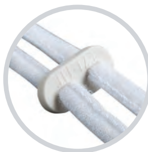
Ezi-Tie® adjusters for increased comfort