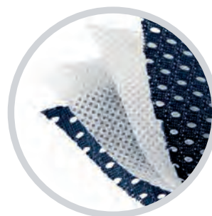
The unique layered lightweight construction