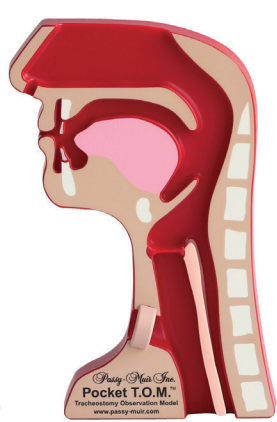
Pocket T.O.M.® Tracheostomy Observation Model