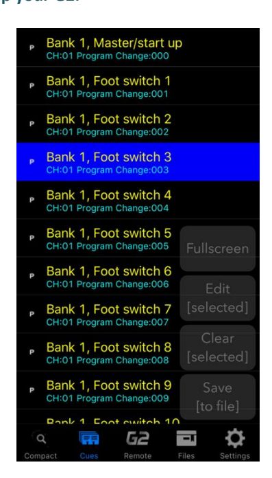
Using your IOS device as a display screen for your G2.