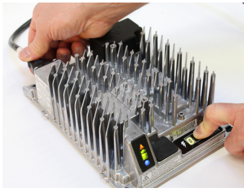
Figure 2: Reconnect AC input while holding the Select Charge Profile Button.