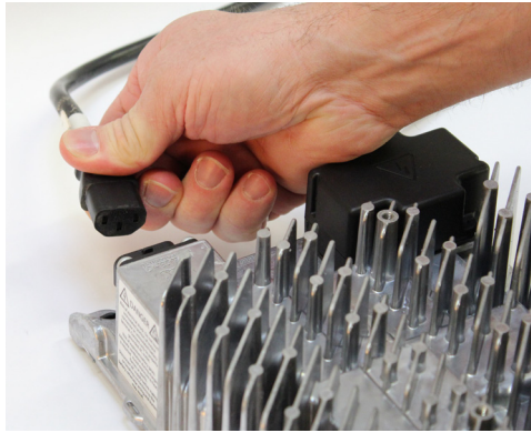
Figure 1: Disconnect AC input from the charger.