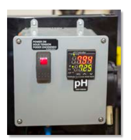
Optional pH controller, WX-0130