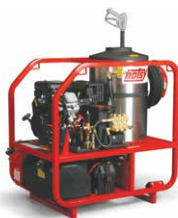
Model 1080BE 4.6 GPM @ 3500 PSI; Briggs Vanguard gas engine (shown with optional stainless steel coil wrap and skid rails)