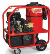
Model 1075BE 4.0 GPM @ 3500 PSI; GX390 Honda gas engine (show ith optional caster kit)