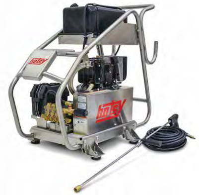
Diesel Model HHD 3.4/30 D with stainless steel frame

50-ft. high-pressure hose for easy maneuverability around a large working area