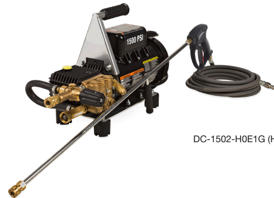
DC-1502-H0E1G (Hand Carry)