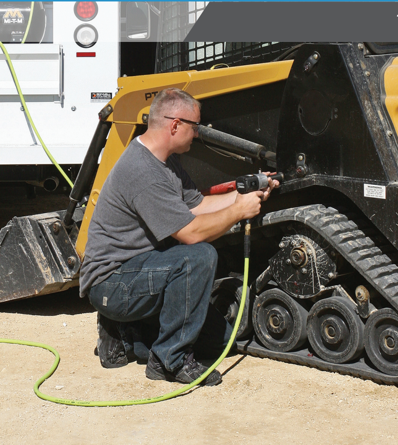
Two Stage — Gasoline