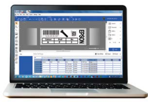
Screen Content Simulated

Use Epson's Label Editor software to create labels for your entire workplace. Print images, bar and QR codes, tables and logos. Batch print by importing spreadsheets.