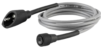
Infrared Wired Non-Contact Temperature Measurement

These components are NOT interchangeable at this time. It is necessary to order your 1025 Sense with only one of the options below.