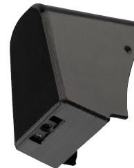
Barcode Scanner for Scan To Print Applications