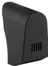
Temperature, Barometric Pressure, Sea Level, Relative Humidity, & CO2