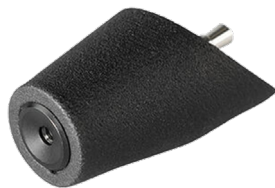
Infrared Button Sensor for Non Contact Temperature Measurements -