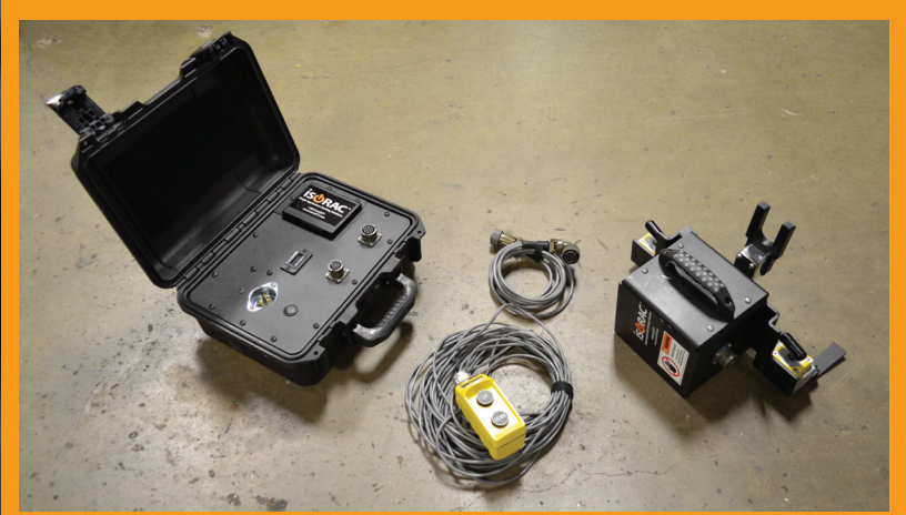
Components consist of isoRAC® Accessory, Portable Control Box, Operation Remote and two (2) connection cables.