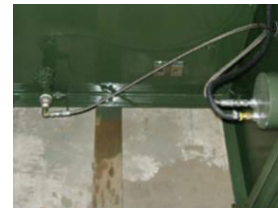
Connection from oil valve