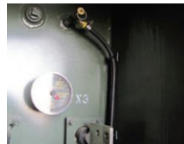
Connection from N2 valve