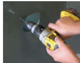
Installer drilling holes

Note: Refer to Installation Instructions for step-by-step instructions on kit installation.