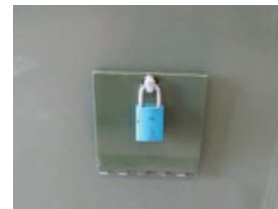
Pad-lockable for Security