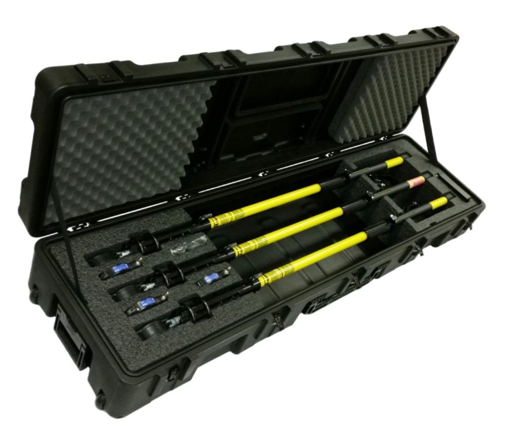
HSTC-3 Kit (3) Hot Stick RFCT shown above. Case comes with foam cut outs for a complete Cable Data Collector System (CDC) which is shown here.