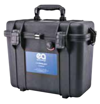
Rugged carry case