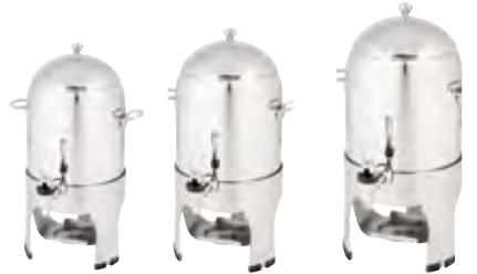
6 QT URN