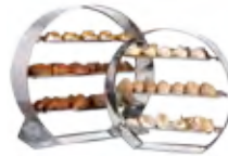
MEDIUM WHEEL SKU: XC3254