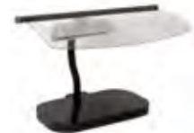
INTEGRA DUAL HEAT WARMING SYSTEM SKU: ISS-600