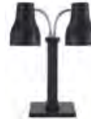
DOUBLE TITANIUM HEAT LAMP SKU: 2792-6EB