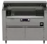
Fire Suppression MAX Induction Griddle MCS Cooking Station, 5000W