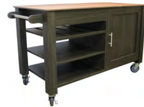
AireServe Mobile Frost Top Serving Cart