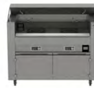
Fire Suppression MAX Induction Cooking Station

SKU: 5200W, MCS-59-FPS-SP261-2 7000W, MCS-59-FPS-SP350-2