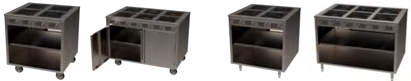
4 or 6-Zone BOH Induction Carts