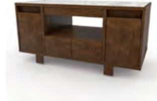
Quick Ship Credenza SKU: QSC6827