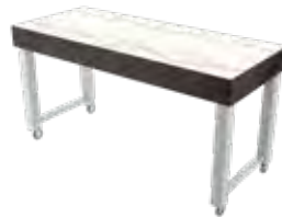
Quick Ship Table SKU: QS7230