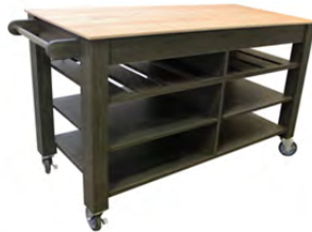
AireServe Mobile Induction Serving Cart