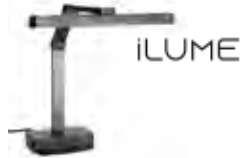
ILUME INFRARED HEAT LAMP, TITANIUM SKU: 2791-ILT