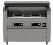
Fire Suppression MAX Induction Wok MCS Cooking Station, 7000W

SKU: 5200W, MCS-59-FPS-SP261-2 7000W, MCS-59-FPS-SP350-2