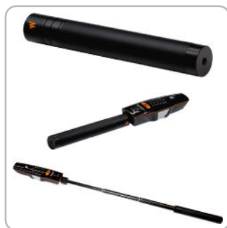
WaveStick Part # WWMA0002

Adjustable extension stick (73 cm / 28,74")