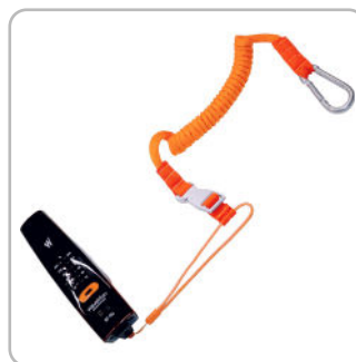
Safety cable Part # WWMA0001

Adjustable extension stick (73 cm / 28,74")