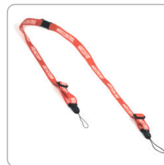
WaveMon Lanyard Part # WWMA0003