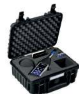
SA 72 Waterproof carrying case