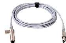
SC 91A Microphone Extension Cable