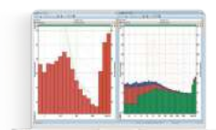
SF 971A_P1 Package 1/1 & 1/3 octave and audio recording