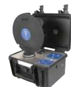
SV 111 Hand-Arm and Whole-Body Vibration Calibrator