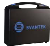
SA 146 Carrying Case for SV 106A and accessories