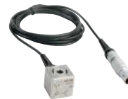
SV 151 Tri-Axial SEAT Vibration MEMS Accelerometer