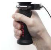
SV 150 Tri-Axial Hand-Arm Vibration MEMS Accelerometer