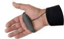
SV 105F Tri-Axial Hand-Arm Vibration Accelerometer with Force Detection