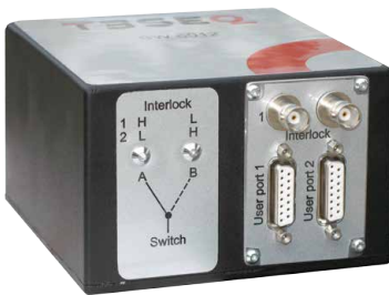
SW 6012 control connector view

The SW 6012 adds two SPDT switches to the built-in switching network of the ITS 6006. It is fully powered and controlled by the ITS 6006. Interlock connections are provided for switching the amplifier gain on/off. Additionally the SW 6012 is supplied with a second user port socket for various applications. The SW 6012 can be controlled by the NSG 4070B (NSG 4070 and NSG 4070A require SW 4070.).