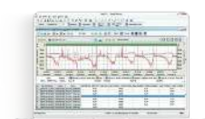
SvanPC++ EM Post-processing software