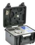
SV 111 Vibration Calibrator