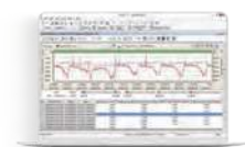
SvanPC++ EM Post-processing software