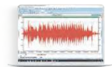
SF 277_15 License of audio recording