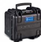
SB 272 External Battery 33 Ah