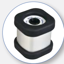
SV 36 Class 1 Acoustic Calibrator 94 dB / 114 dB at 1 kHz