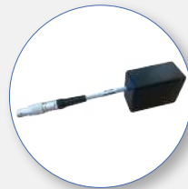
SP 200 LAN Adapter