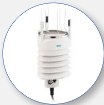
SP 275 Weather Station based on VAISALA module