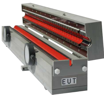
View to the EUT side of the opened MDS 21B