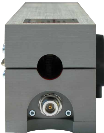
View to the AE side and RF connector