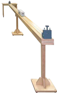
MBT 2 view from the AE side

Teseq GmbH Landsberger Str. 255 · 12623 Berlin · Germany T +49 30 56 59 88 35 F +49 30 56 59 88 34 info.rf.cts@ametek.com www.teseq.com