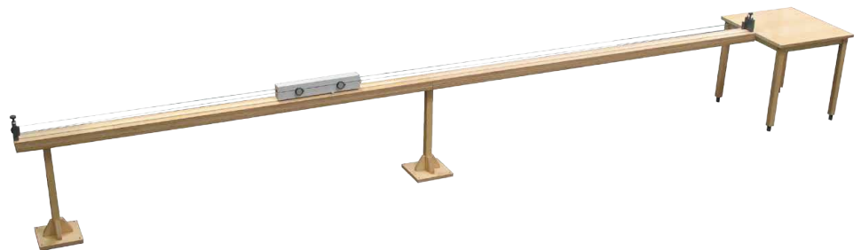
MBT 2 with optional MDS 21B, side view