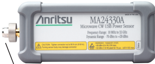
K and V Type connectors designed for use with a torque wrench ensuring repeatable connections