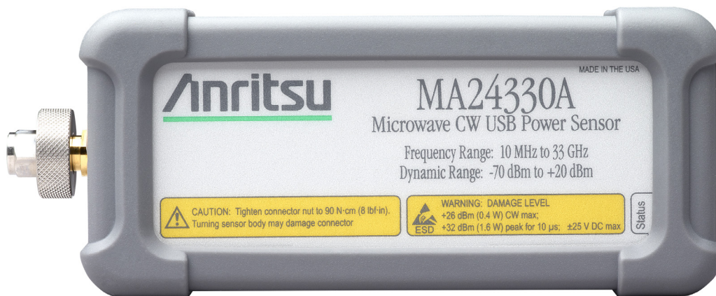
MA243x0A Series Microwave CW USB Power Sensors