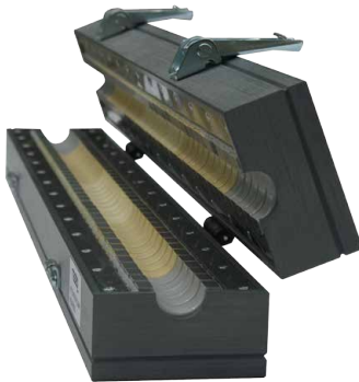
KEMA 801A, side view

The KEMA 801A is recommended as an additional decoupling network (ferrite tube clamp) for immunity test according to IEC /EN 61000-4-6 when using the clamp injection method. It shall be inserted on all the cables between EUT and AE except the cable under test. The KEMA 801A prevents, that the test signal applied to the EUT affects other devices, equipment or systems, which are not under test and improves the reproducibility of the test results.