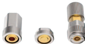
CALIBRATION KIT IM9905

For more information regarding the use of the Calibration Kit with the test fixture, please contact your local Hioki distributor.