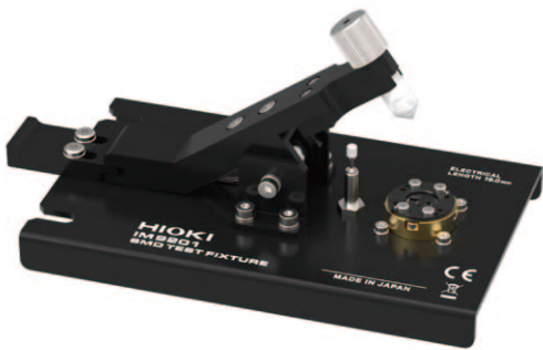
SMD TEST FIXTURE IM9201