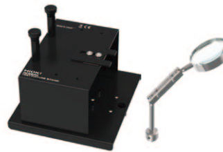
TEST FIXTURE STAND IM9200 (includes magnifying glass)

The following provisions are required when using the test fixture with the Hioki IM7580 series.