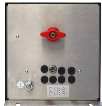
HV-AN 150, view to the AE port

AMETEK CTS Europe GmbH Landsberger Str. 255 · 12623 Berlin · Germany T +49 30 56 59 88 35 F +49 30 56 59 88 34 info.rf.cts@ametek.com www.teseq.com