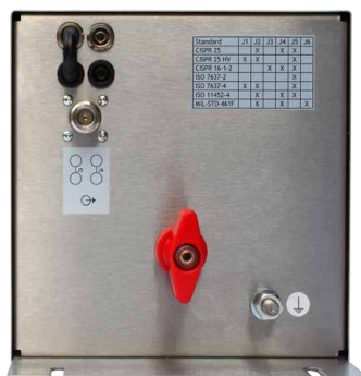
HV-AN 150, view to the EUT port