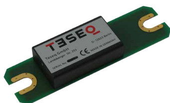
EXT 10uF, option external 10 µF capacitor for RTCA/DO-160G