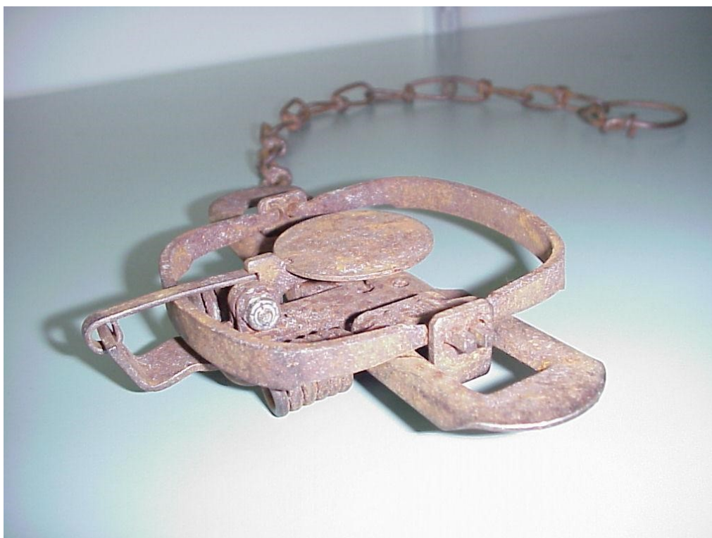
Figure 4. Traps should be set fine (i.e. trap dog just under the trigger latch) with the trigger plate at the same level as the jaws.

Wire or nylon cord can be used to secure traps to soft or small sites that cannot hold a staple securely (e.g. punga). In areas such as open tussock country and flax areas where there are no suitable anchor points for traps and/or no backing for lure, then stakes or backing boards must be used. The stakes/boards must be 50 cm long and 10 cm wide. They must be white on both sides, either white corflute or a painted board or similar. If a road marker is used it must not incorporate any reflective material. The white board creates the visual 'blaze'