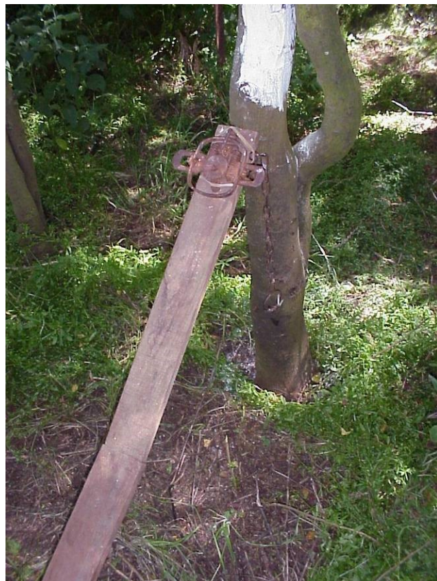
Figure 5. Raised set. Raised trap set on a leaning board at approximately 450 and showing the position of the chain (directly under the trap), the rubber band holding the trap to the board, the trap dog towards the tree, lure extending upwards for a height of 50

In areas where suitable sites for deploying raised sets are scarce, 50 mm x 50 mm wooden battens may be driven into the ground to provide for a raised set to 700 mm. White corflute 50x10 cm is nailed to the batten to extend above the trap for a visual blaze. The same nails can be