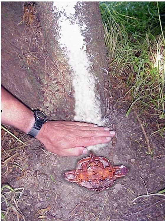
Figure 2. Traps should be bedded into the substrate, approximately one hand width from the trunk of the tree, and with the trap dog nearest the tree. Note that the trap site has been cleared of obstructions.

Bark must NOT be removed from trees to aid application of flour lure under any circumstances. Best efforts to minimise any lure spillage in excess of the specified application must be made. Where lure is inadvertently spilt on the ground or trap, it should be removed or scuffed into the substrate.