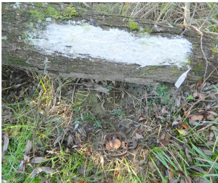
Figure 3. If using a log (or tree root) that is less than 50cm high as a backing for the trap, smear the flour along the log behind the trap, creating a horizontal blaze of 50cm (+/- 10cm) directly above the trap.