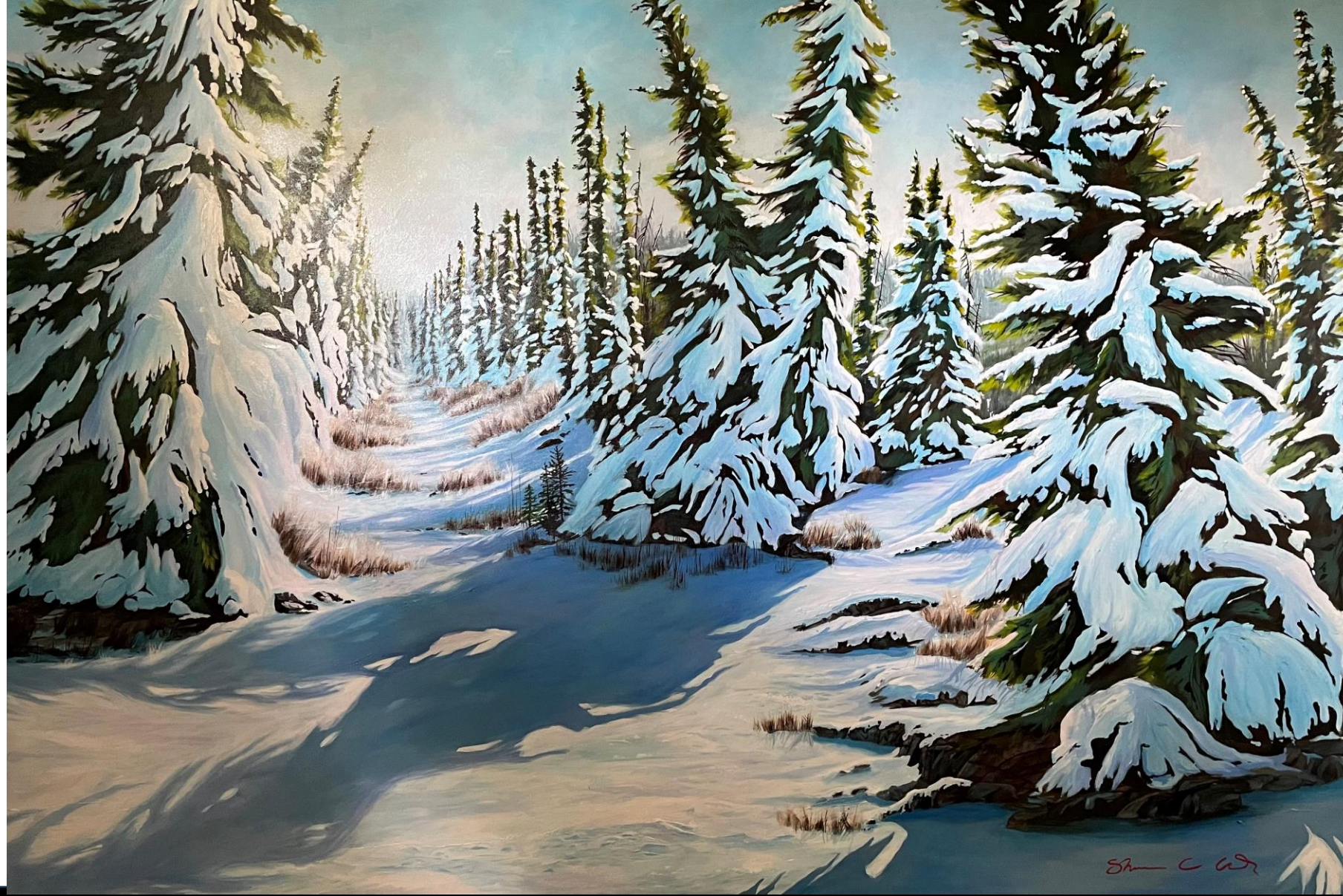
Yoo Hoo Caribou! 48" x 72"

It was completed to bring awareness to the first major project aimed at rehabilitating seismic lines.