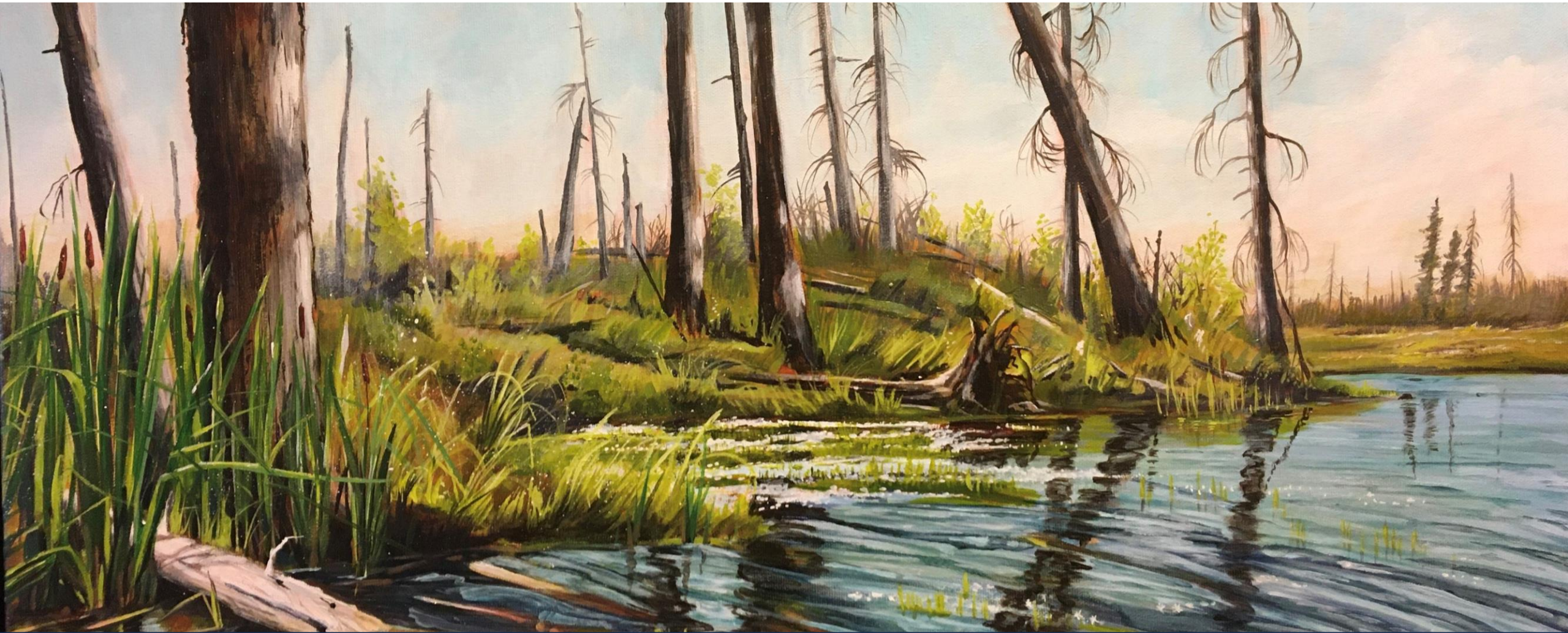
Fort Hills No Net Loss Lake 12" x 24" Acrylic on canvas, framed

This painting was inspired by Fort Hills engineered lake to offset development in the area, this project is a great example of how species are protected and thrive when industry commits to the environment.