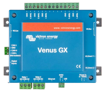
Venus GX with connectors