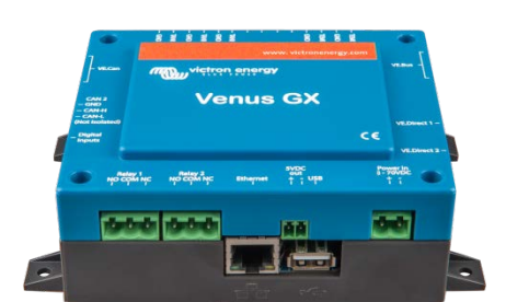
Venus GX front angle